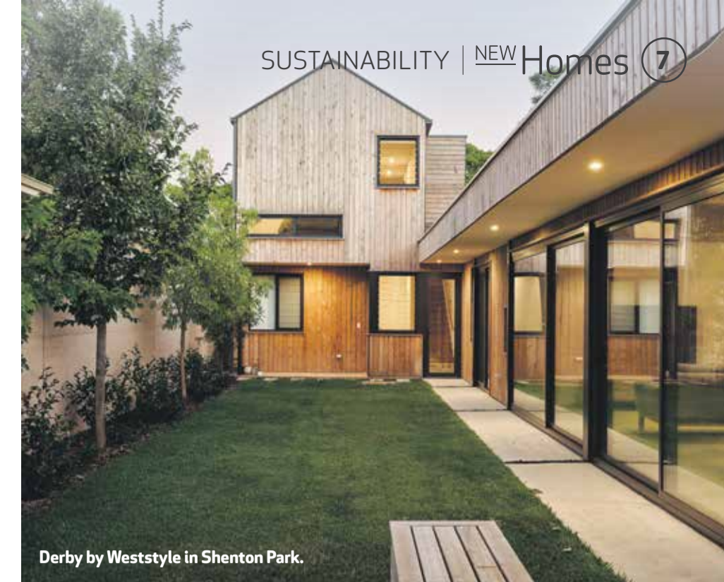
Derby by Weststyle in Shenton Park.

CONTACT Weststyle, 9345 1565 www.weststyle.com.au